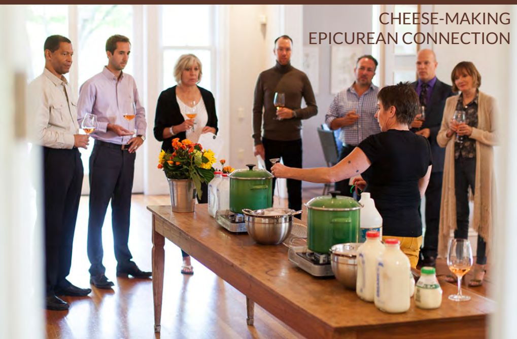
CHEESE-MAKING EPICUREAN CONNECTION

Golf as the sun rises along the coast at Links in Bodega Bay or start the day with a rejuvenating private group yoga lesson. For team-building activities with a wine country twist, take a cheese-making class with an award-winning chef and cheese-maker or test the group's wine-making skills with a wine blending class at Meadowcroft Wines. Enjoy the fruits of your labor with a culinary class at Ramekins Culinary School in Sonoma or Relish Culinary Adventures in Healdsburg.