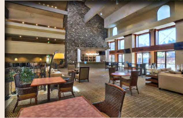
DOUBLETREE BY HILTON HOTEL SONOMA WINE COUNTRY