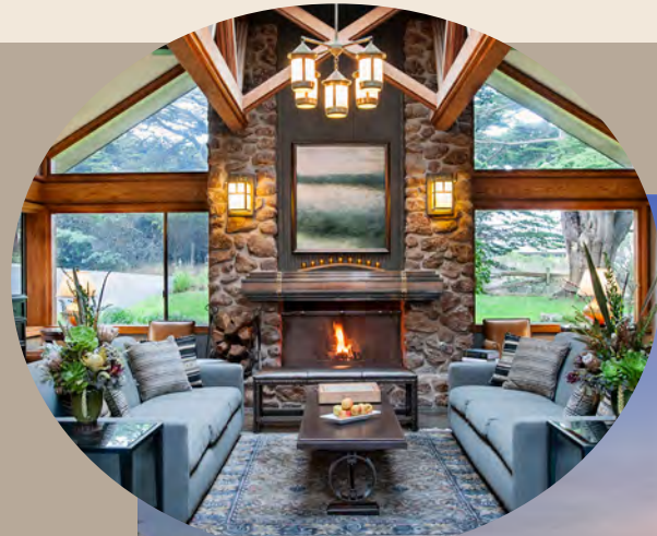
BODEGA BAY LODGE