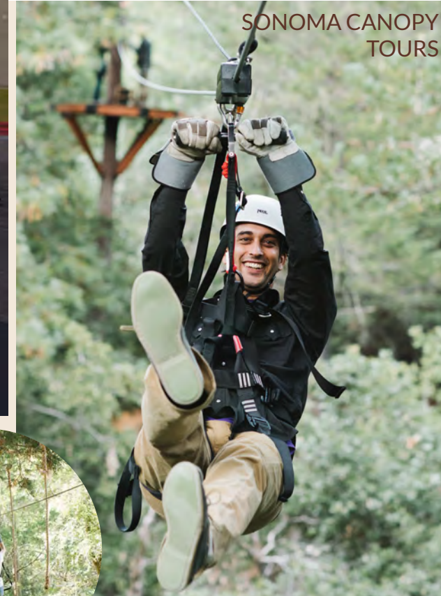
SONOMA CANOPY TOURS

Whether your group is taking a private paddle experience down the river, a sip 'n' cycle tour through vineyards or down a country road, horseback riding along the coast, or enjoying a hike through the redwoods, the magic of the region's natural beauty is unparalleled and intoxicating. For adrenaline adventures, get behind the wheel at Sears Point Racing Experience in anything from a 125-cc racing kart on up to a Formula 3-derived race car, zipline through the redwoods, or take in scenic views while soaring high above in a hot air balloon. Sonoma Wine Country offers a wide array of dynamic, customizable thrills than can be catered to your group.