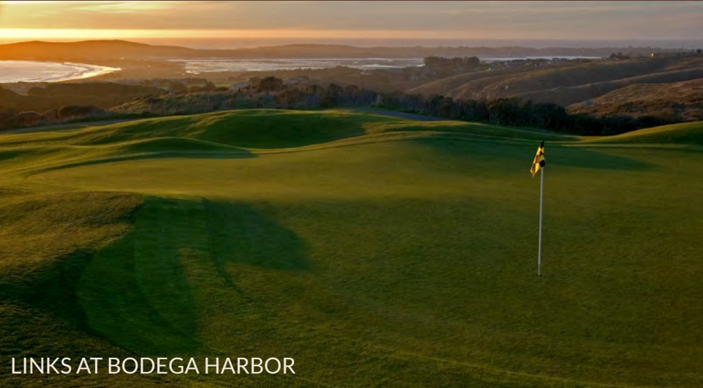
LINKS AT BODEGA HARBOR