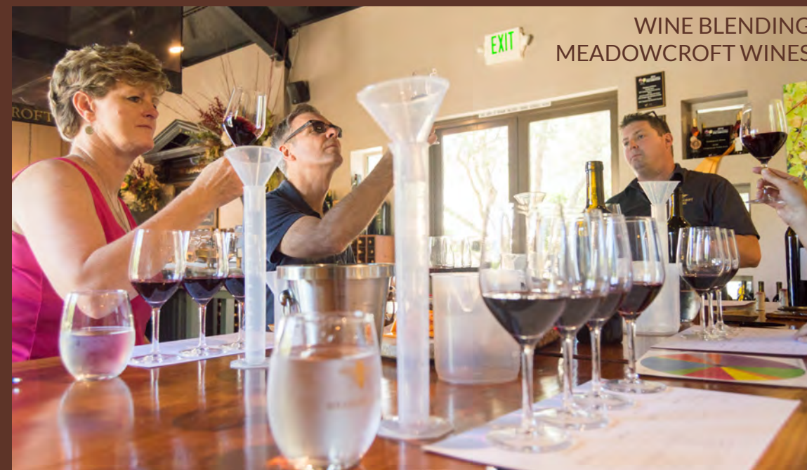
WINE BLENDING MEADOWCROFT WINES