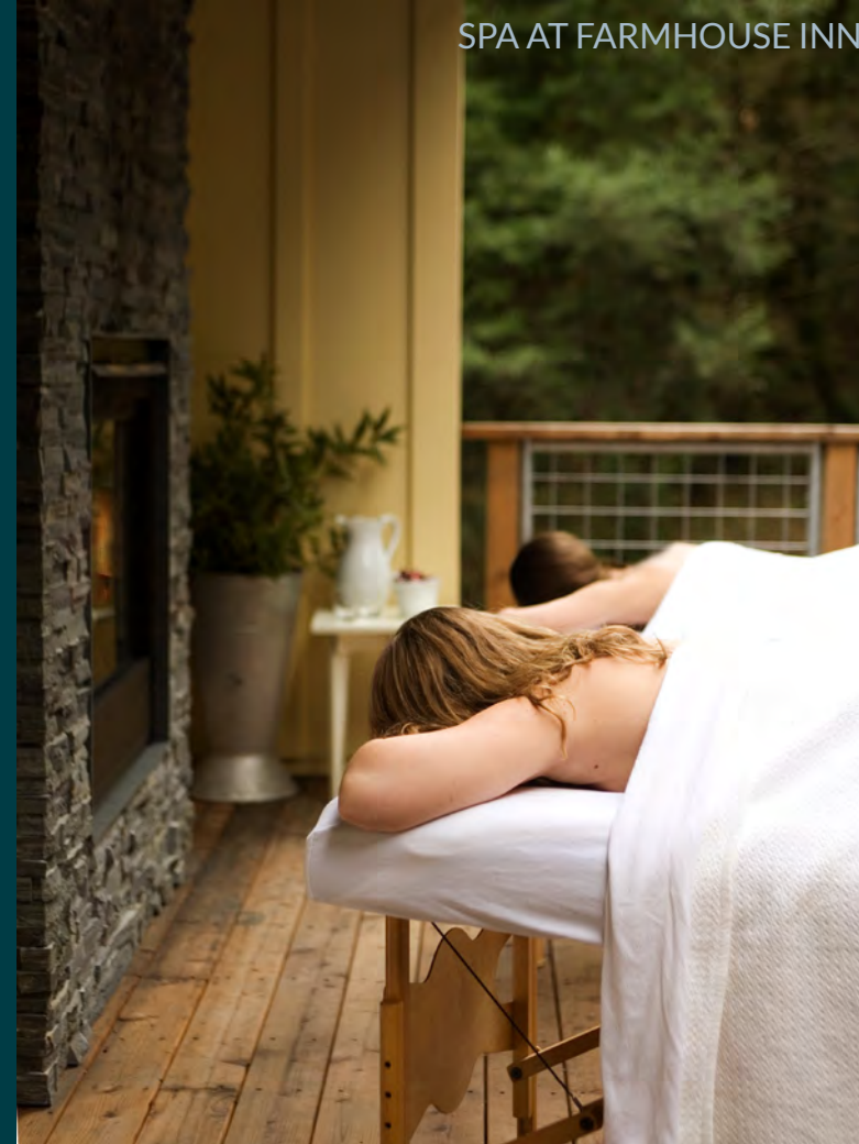
SPA AT FARMHOUSE INN