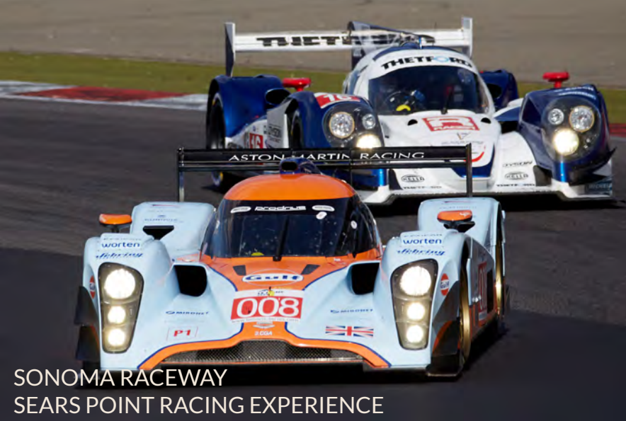
SONOMA RACEWAY SEARS POINT RACING EXPERIENCE