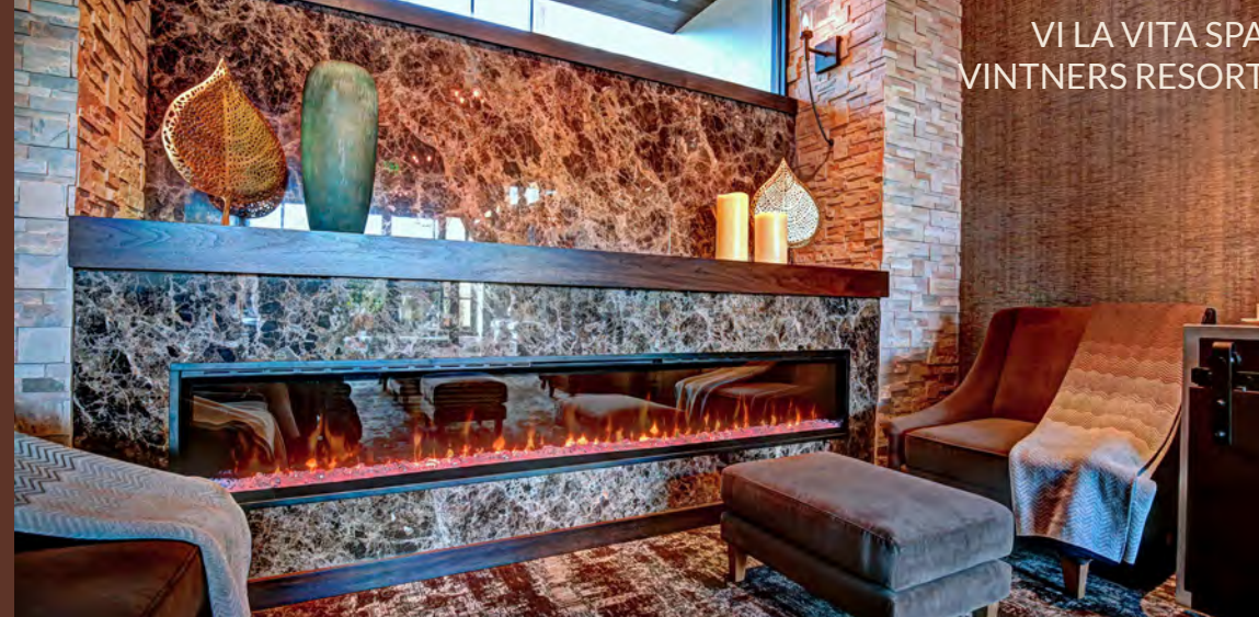
VI LA VITA SPA VINTNERS RESORT