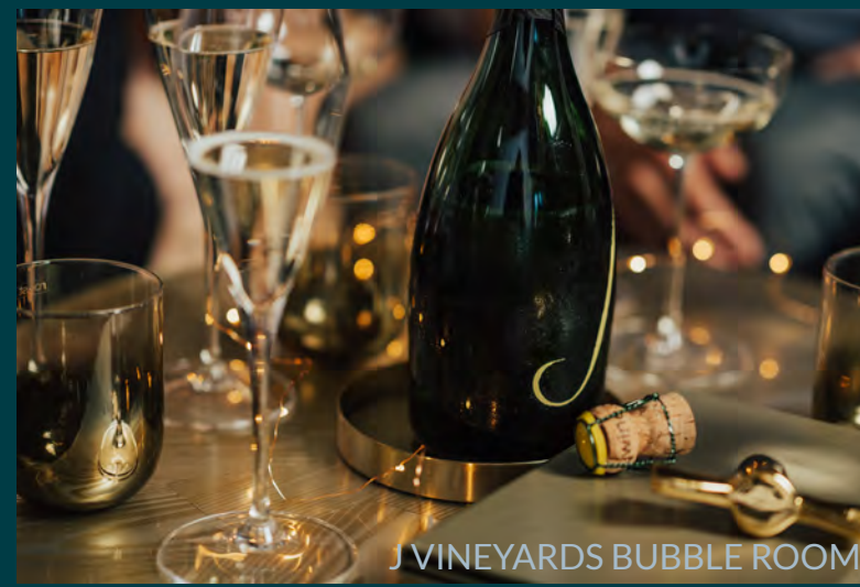
J VINEYARDS BUBBLE ROOM

After a day of unique culinary and wine experiences, wind down with a custom massage using immune-enhancing oils at the Farmhouse Inn in Forestville.