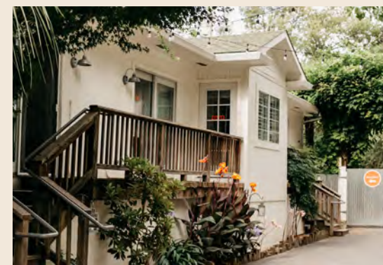
BOON HOTEL + SPA