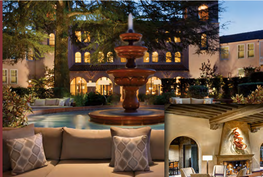
FAIRMONT SONOMA MISSION INN & SPA