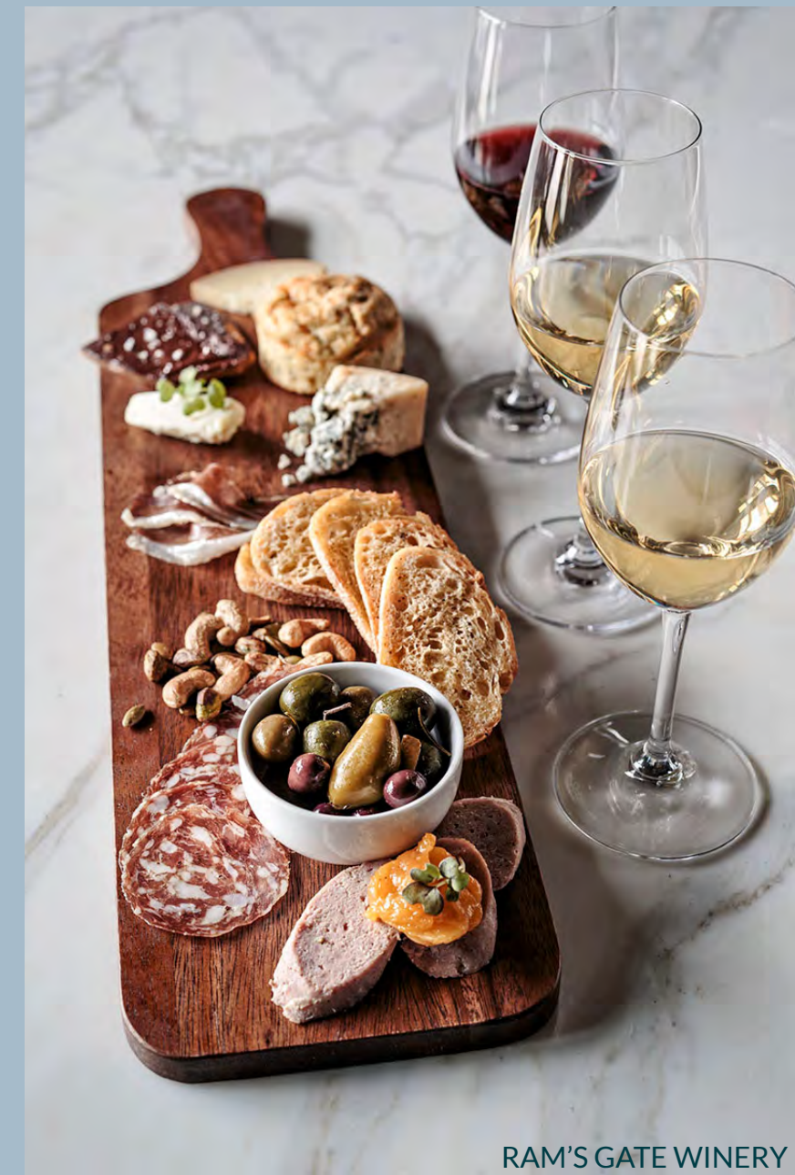
RAM'S GATE WINERY