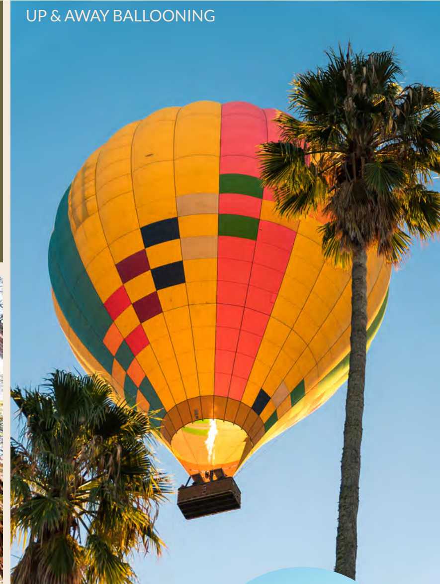
UP & AWAY BALLOONING

Whether your group is taking a private paddle experience down the river, a sip 'n' cycle tour through vineyards or down a country road, horseback riding along the coast, or enjoying a hike through the redwoods, the magic of the region's natural beauty is unparalleled and intoxicating. For adrenaline adventures, get behind the wheel at Sears Point Racing Experience in anything from a 125-cc racing kart on up to a Formula 3-derived race car, zipline through the redwoods, or take in scenic views while soaring high above in a hot air balloon. Sonoma Wine Country offers a wide array of dynamic, customizable thrills than can be catered to your group.